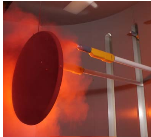
ITW Gema's family of positioners create superiorly coated products

Built to withstand the rigors of the powder coating environment, ITW Gema has designed the ZA RECIPROCATOR and XT POSITIONER to be tough and durable. The solid construction of these machines enable heavy loading capabilities and high stability.