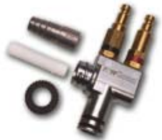
ITW Gema's OptiFlow™ Pump with only two major wear parts for high reliability and low operational costs.

ITW Gema systems, components and parts are CE, PTB and FM certified and licensed. By using aftermarket replacement parts, you may void these certifications.