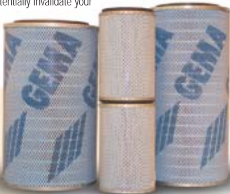
ITW Gema filter cartridges feature a specifically designed media that separates particles down to 0.3 microns.

Aftermarket replacement parts are poor imitations of the real thing... genuine ITW Gema parts...and can potentially invalidate your warranty or worse yet, cause system malfunctions and create dangerous situations for your operators.