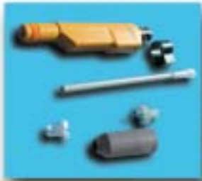
ITW Gema's OptiGun™ equipped with the patented self-cleaning electrode.

The use of aftermarket replacement parts can affect final finish quality and system reliability, as well as add to system downtime, and compromise the safety of your operators. You might save money in the short-term, but aftermarket replacement parts can cost you a lot more in the long-run.